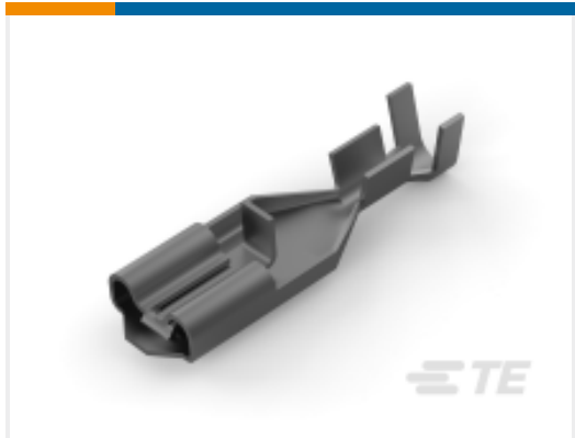
TE Part # 170328-1 250 PL MKII REC. 18-14AWG PTBR