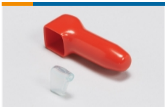
Insulation Boots & Sleeves(4)