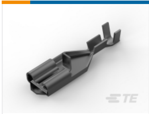
TE Part # 170327-1 250 PL MKII REC. 22-18AWG PTBR