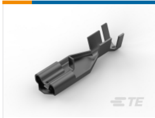
TE Part # 170329-1 250 PL MKII REC. 15-10AWG PTBR