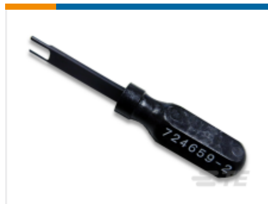
TE Part # 724659-2 EXT TOOL FOR POSITIVE .250