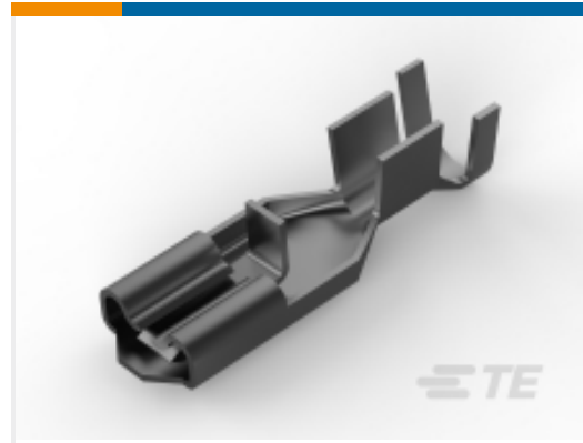
TE Part # 63239-1 POSITIVE LOCK 250 REC 12-10 AWG TPBR