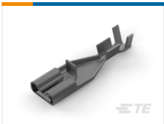
TE Part # 170334-1 205 PL MII,REC.,18-14,PTBR