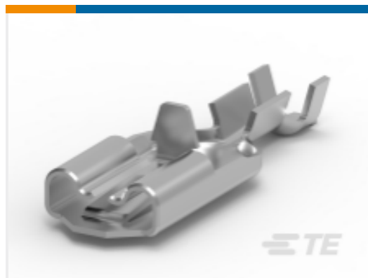
TE Part # 2238156-1 POS LOCK 250 Rec, MKII, 22-18 TPBR