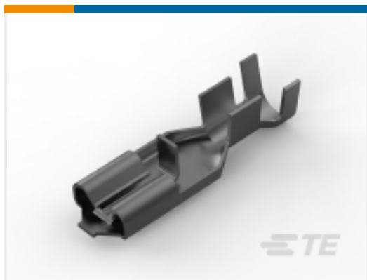
TE Part # 170335-1 PL 250 RECEPTACLE 15-10 AWG PTPBR