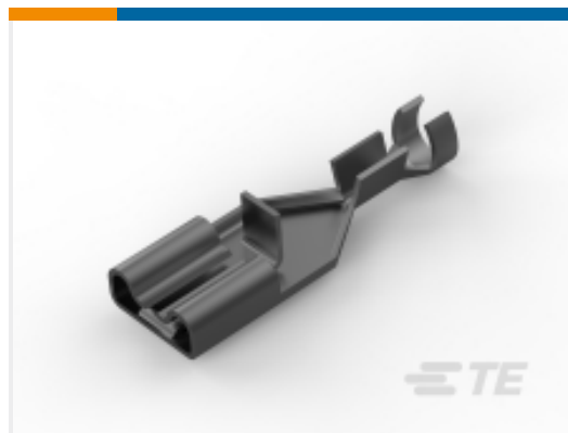
TE Part # 170333-1 PL 250 RECEPTACLE 22-18 AWG PTPBR